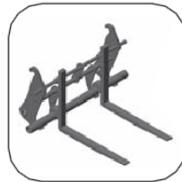
Forks Mounted on Quick Coupler

24/7 CUSTOMER SERVICE ANYTIME. ANYWHERE.