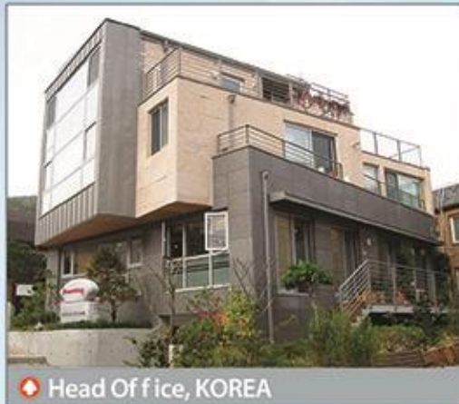
Head Of f ice, KOREA